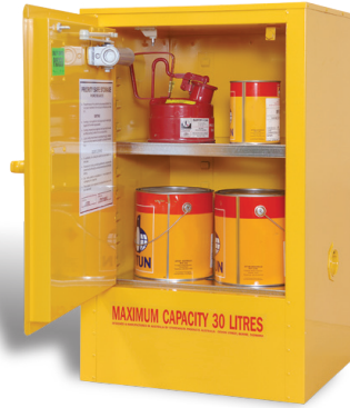
30 Litre - 1 Shelf + Base Code: 47-F30