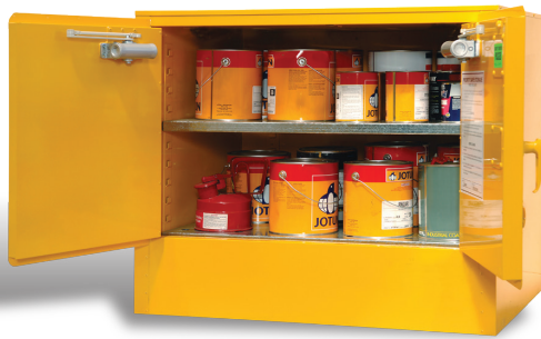
100 Litre - 1 Shelf + Base Code: 47-F100