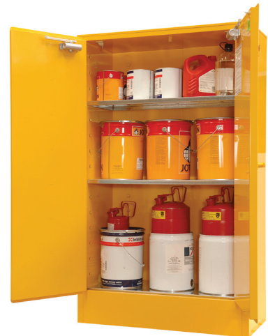
250 Litre - 2 Shelves + Base Code: 47-F250