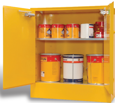
160 Litre - 1 Shelf + Base Code: 47-F160