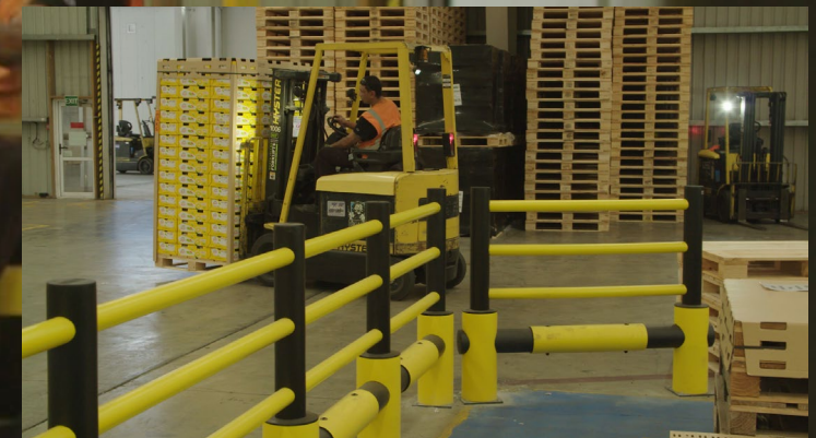
Shock-absorbent, high impact protection.

https://vanguardgroup.co.nz/d-flexx-flexible-safety-barriers/