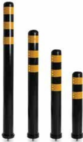
Cityflex Ø8 range

Vanguard's CityFlex Post is a product designed for delineation on roads, parking areas and bike paths. It operates as a deterrent, reducing the risk of road accidents and providing clear and aesthetic separation on the road. Due to the manufacturing method and material, the CityFlex post provides full flexibility, returning to its original form after an impact. Available in a range of different colours for aesthetic delineation.