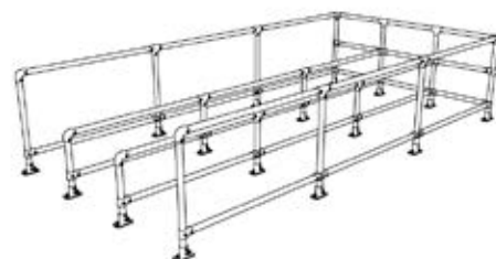
Trolley Bay Triple