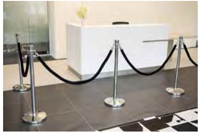
Create an up-market look to areas