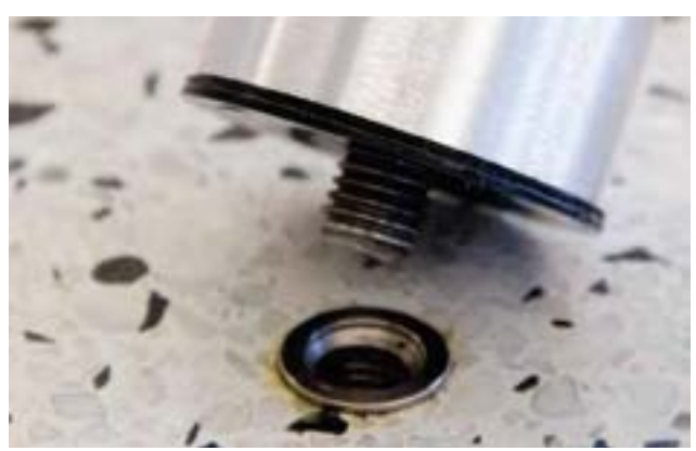
Post screws into receiver holes for instant use leaving no surrounding base as a tripping hazard.