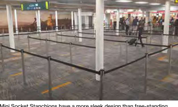
Mini Socket Stanchions have a more sleek design than free-standing alternatives, saving space and creating a tidier look.