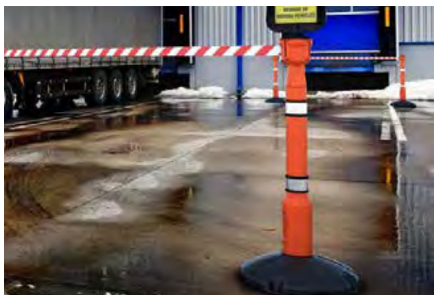
Skipper Posts are stable in strong weather due to their water or sand fillable base.