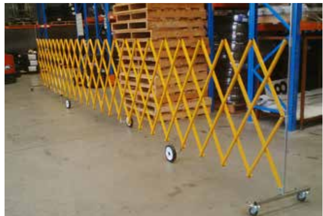
Wheel the Mobile Expanding Barrier in to your desired location and then expand to cordon off exclusion zones.