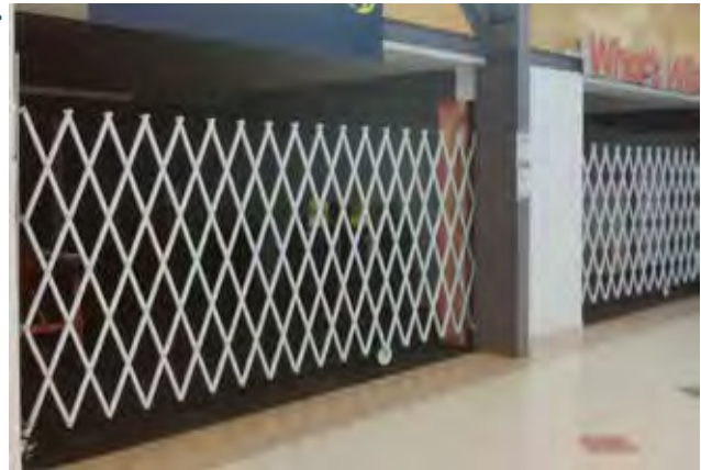
Fix the Wall Mounted Expanding Barrier to a flat surface and expand to cordon off exclusion zones. (Custom colour shown).