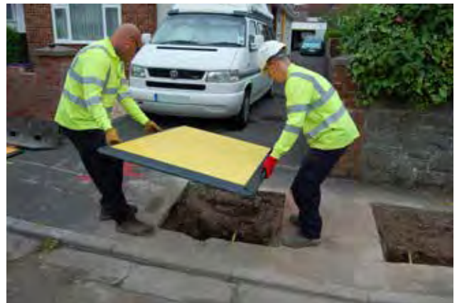
Two-person lift, can support a 3.5T distributed load.