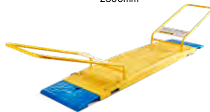
Lifting handles for two-person movement. No lifting machinery required.