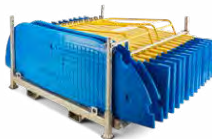
Forkliftable Stillage for efficient transport and storage.