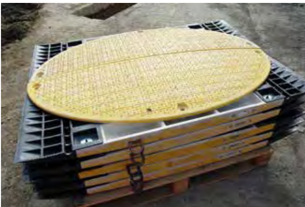
Road Plates stack compactly for efficient transportation.