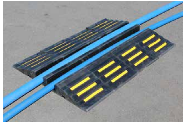
Hoses/pipes drop into Hose Ramp channels.

Number of channels: 2 Channel width: 150mm Channel height: 130mm Weight: 22 kg