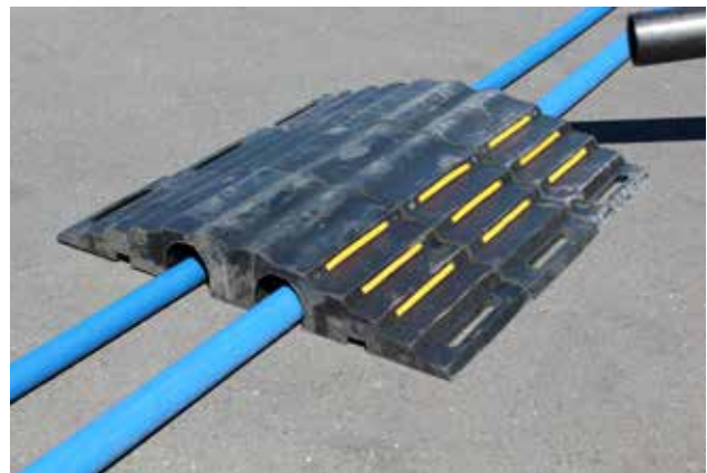
Hoses/pipes sit protected underneath Rubber Hose Bridges.

Number of channels: 2 Channel width: 97mm Channel height: 90mm Weight: 19 kg