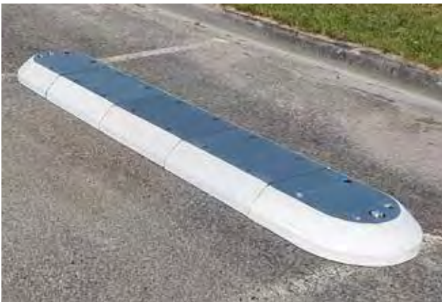
Rubber Cycleway and Traffic Islands are modular allowing you to create sections of any length.