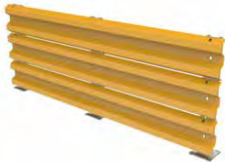
(Shown with optional Floor Mounted Pallet Stopper - see page 37)