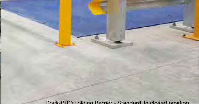
Dock-PRO Folding Barrier - Standard. In closed position.