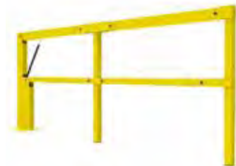
Dock-PRO Folding Barrier - Bifold. In closed position