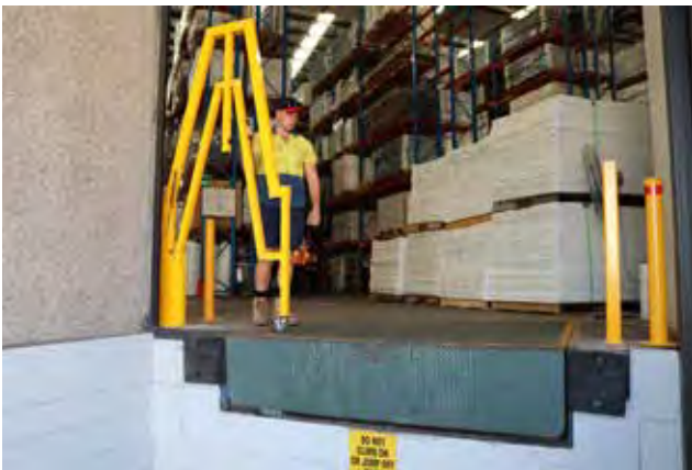
Dock-PRO Folding Barrier - Bifold. In half open position.