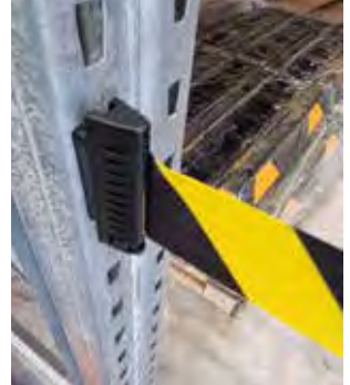
The base unit and belt ends magnetise to steel surfaces.