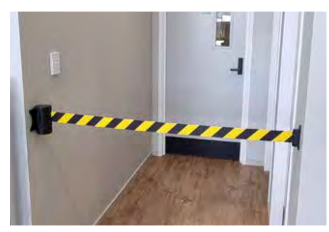
Easily cordon off doorways for restricted access.