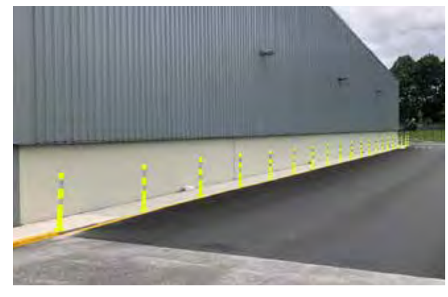
Ultraflex Delineators are ideal for busy areas as they can take multiple hits and return to their original shape.