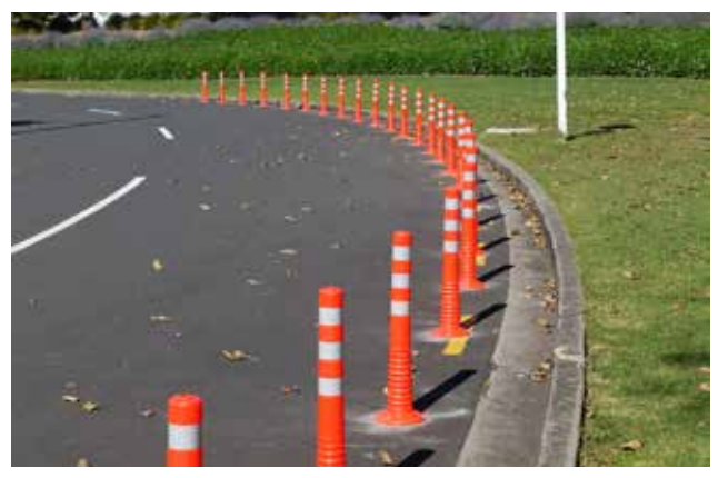
The hi-vis orange Flexible Bollard is great for directing vehicles away from pedestrian zones.