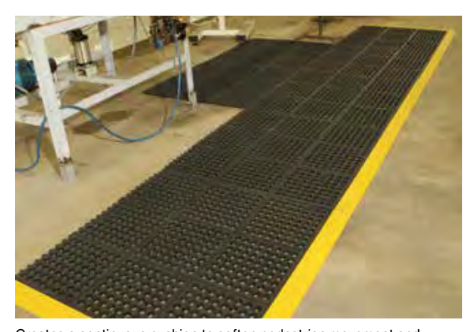
Creates a continuous cushion to soften pedestrian movement and prevents buildup of \mbox{dirt}.