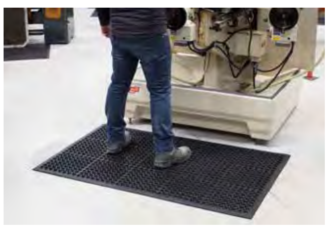
Commonly used in areas where staff are standing for over an hour daily.