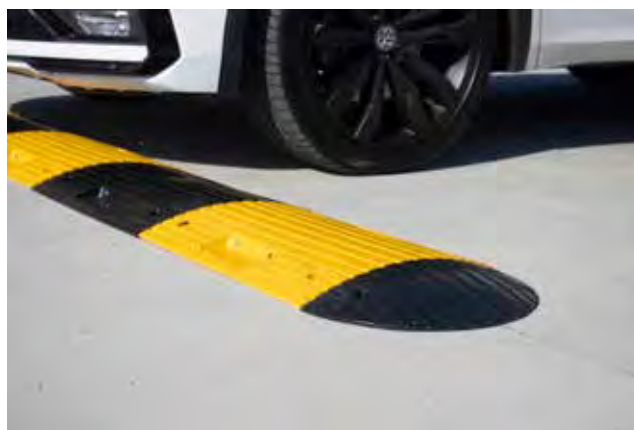
Reflective cat's eyes and interlocking design make this a popular option.