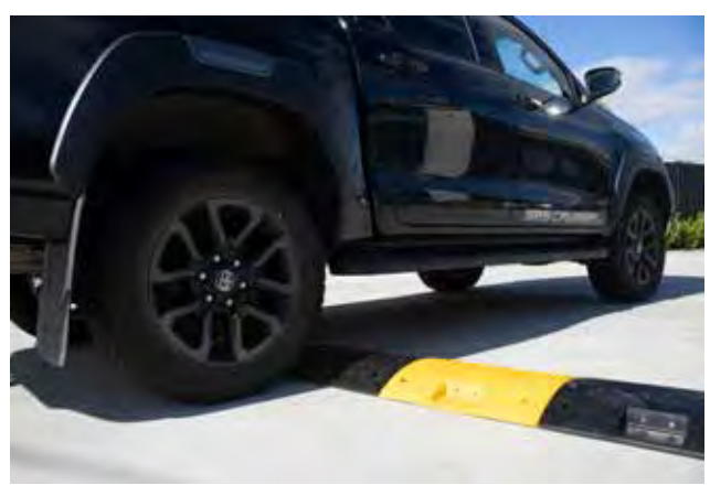
Use for blind exits or driveways exiting across footpaths.