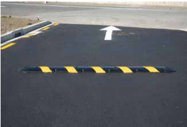
Ideal for single lane driveways.