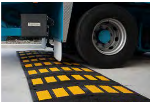
Used in shared areas for cars and trucks.