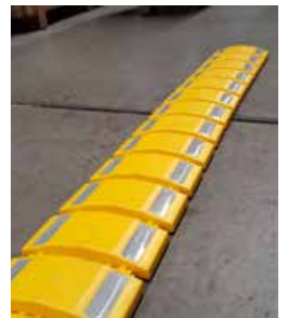
Simply remove from carry bag and roll out for instant use.