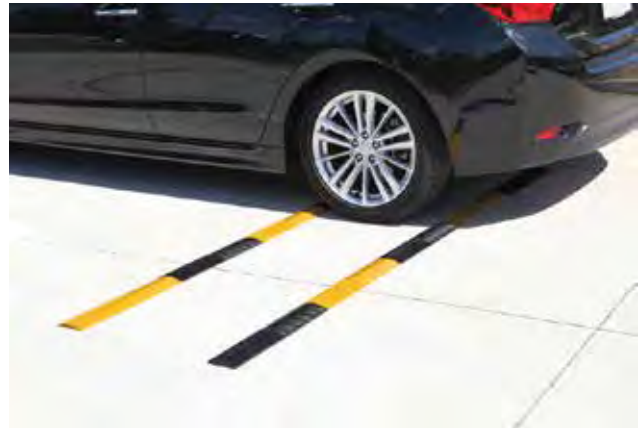
Rubber Rumble Strips create a rumble effect that slows speed when driven over.