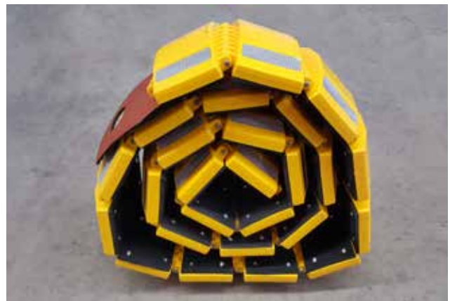
Roll up speed humps are lightweight and sturdy.