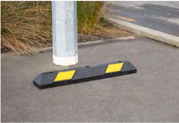
900mm Rubber Wheel Stops are suited for unique situations like asset protection shown here.